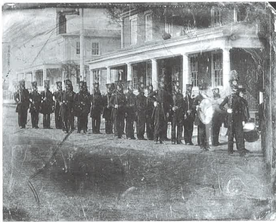
Volunteers from Exeter, New Hampshire, line up as they leave New England to fight in the war against Mexico.