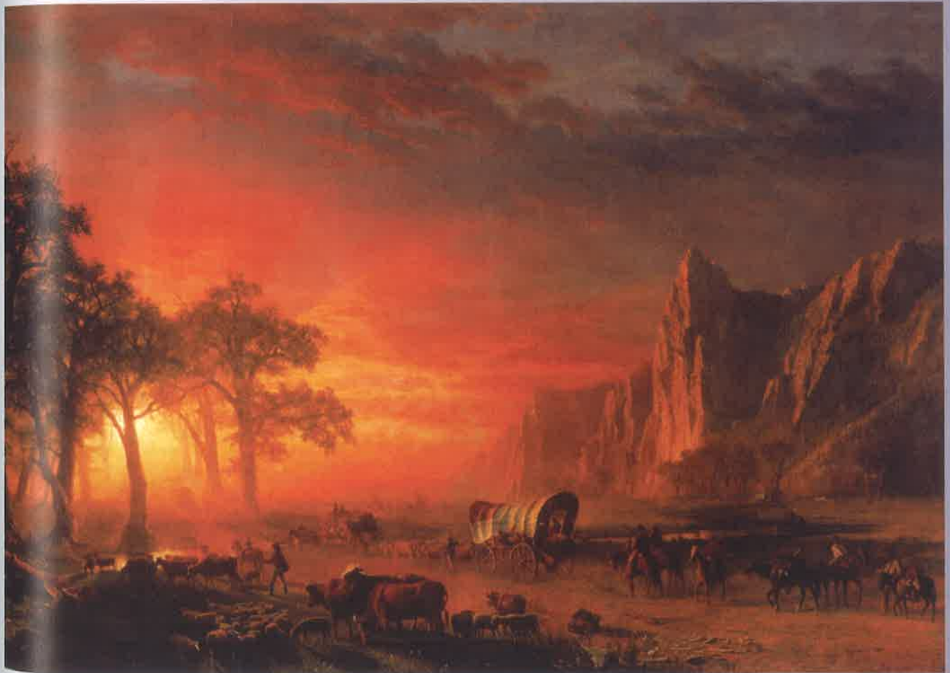
Emigrants Crossing the Plains by Albert Bierstadt, 1867. Oil on canvas. Catalog Number 72.19. National Cowboy & Western Heritage Museum, Oklahoma City, OK.

As the 19th century progressed, more and more settlers were lured to the West by hopes of free land and an independent and prosperous life.