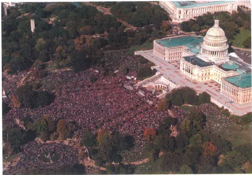
On October 16, 1995, hundreds of thousands of black men marched and assembled at a rally on the steps of the United States Capitol. The demonstration was called the "Million Man March," and it illustrates the importance of the First Amendment.

The marchers challenged their arrests in court, claiming that their protest was protected under the First Amendment's right of assembly. The Supreme Court agreed that the marchers had assembled peacefully. If anyone should have been arrested, it was the mayor's neighbors.