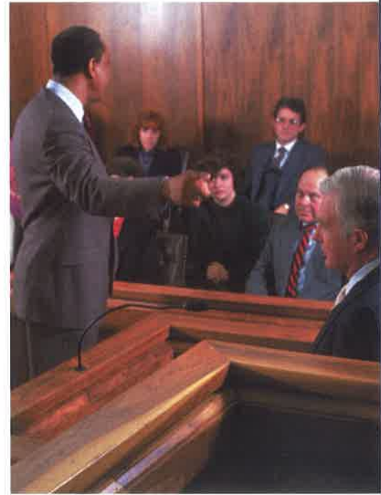
A lawyer tries to convince the jury to decide in his client’s favor during a trial. The right to a jury trial is one of a number of citizen protections found in the Sixth Amendment.

Today, Americans continue to debate whether the death penalty should be banned under the Eighth Amendment. Opponents of the death penalty have argued that executing anyone is a cruel and unusual punishment, no matter how horrible their crime. The Supreme Court has disagreed. In a 1976 case known as Gregg v. Georgia , the Court ruled that “the punishment of death for the crime of murder does not under all circumstances, violate the Eighth Amendment.”