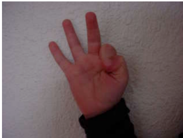
I can do it again.