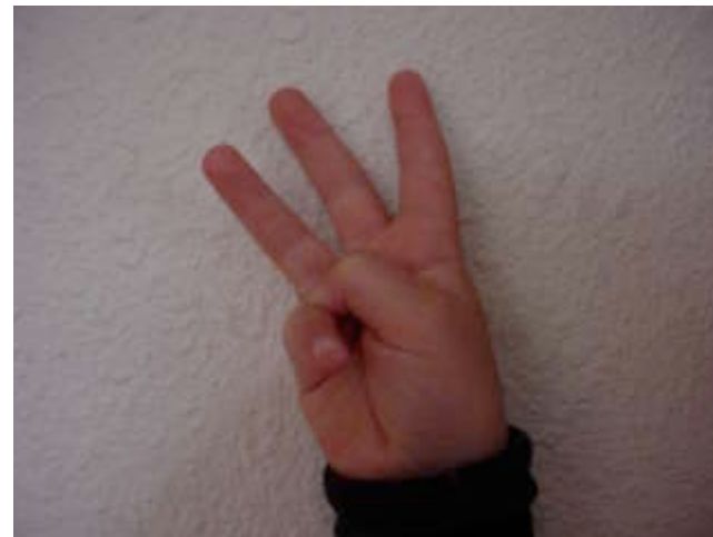
You can count 3 fingers every time.