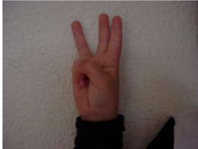
I can hold up three fingers.